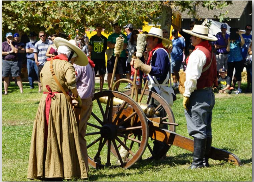
California Living History Specialists portray members of the Mormon Battalion of the US Army of the West prep and fire the cannon twice a day during Gold Rush Days.