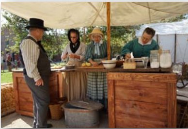
Old Sacramento, CA September 2-5, 2016