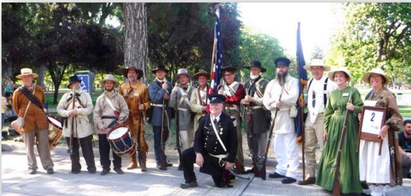
The Mormon Battalion arrives at Liberty Park after marching on the parade route