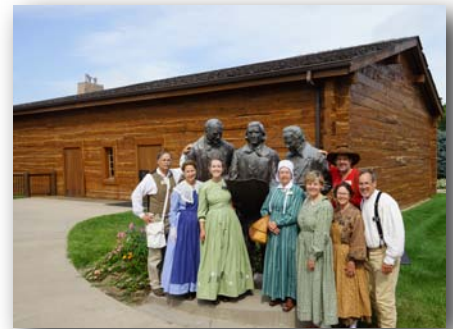
Group attends Memorial Service at the Kaneshville Tabernacle