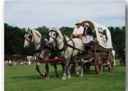
Wagon teams circle up at the Iowa School of the Deaf

Historically, there were members of the Mormon Battalion who returned to their families in Council Bluff and remained in Iowa after 1847. Of the California contingency who came to the 170 th Grand Encampment, a few were also descendants of members of the Mormon Battalion. Those descendants whose ancestors shared a common beginning over 170 years earlier greeted one another warmly and discussed family histories together.